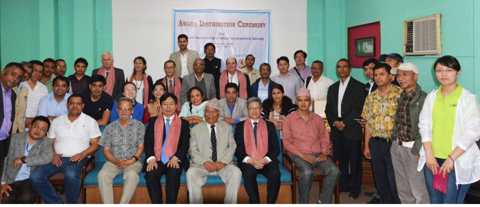
Group Photo of Award Ceremony