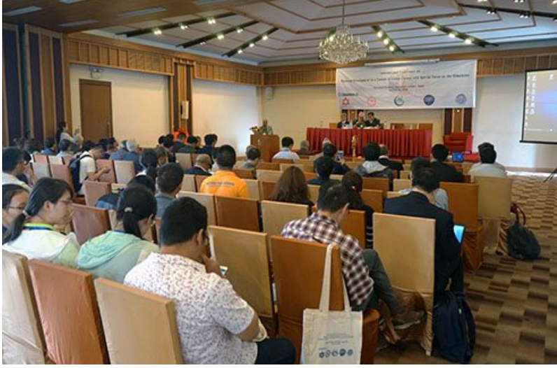
Workshop on Integrated Mountain Development in HKH Region under Climate Change

change on mountain environment and its ecological response, mountain natural resources sustainable utilization and management, mountain natural environment and disaster management and control, mountain tourism, mountain livelihood coordination and sustainable development, and mountain development policies. Over 120 participants from Nepal, China, France, Japan and U.S. etc. attended this workshop.