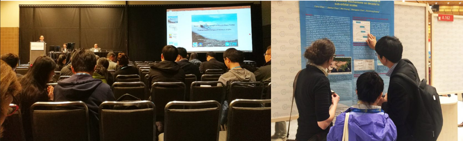
TPE Seesion Posters