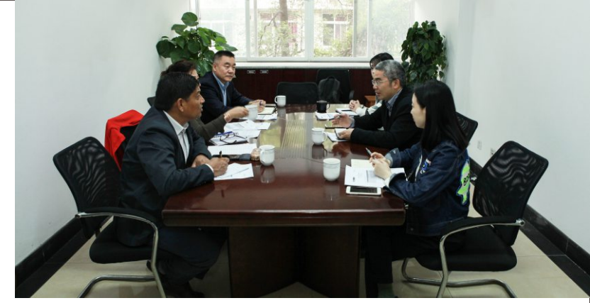
ICIMOD-CNICIMOD Annual Meeting